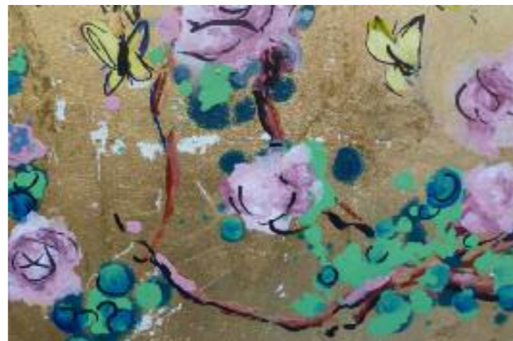
Rachel Brown - goldleaf on board