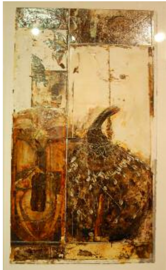
Erroll Mitchell - mixed media