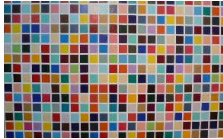
Patrick Blower - acrylic on canvas