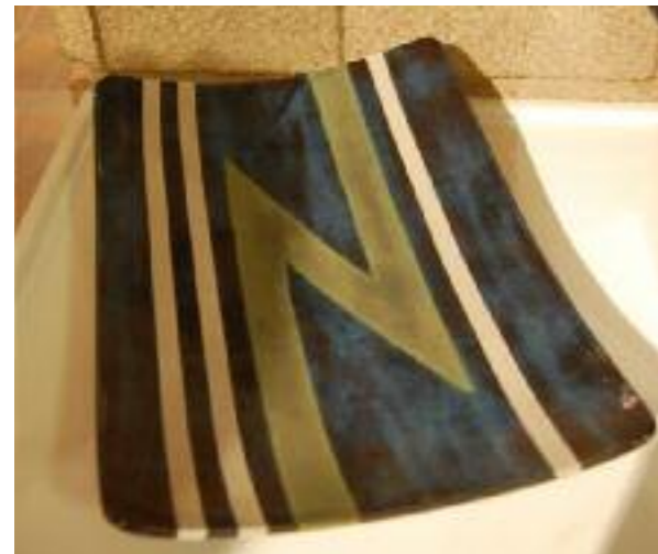
Sonia Watson - ceramic